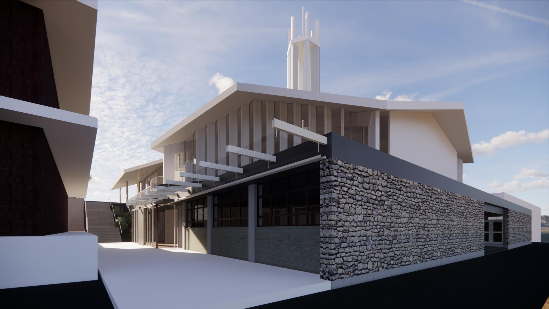
DEVON ST - LANE WAY ENTRANCE