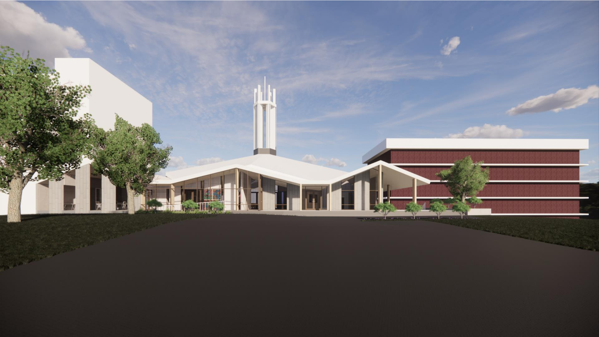
POWDERHAM ST VIEW