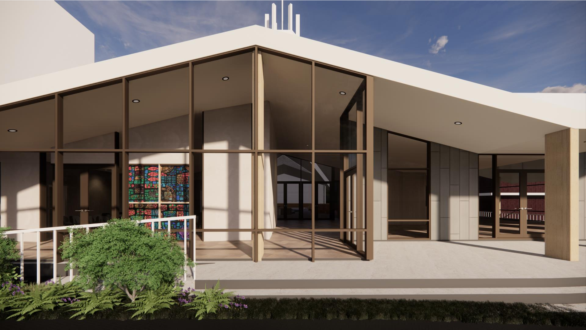
FOYER & DAY CHAPEL