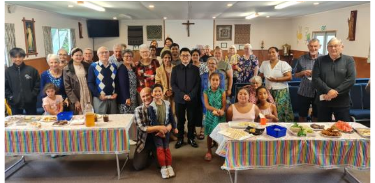
Morning tea with the Bell Block community after Mass at Bell Block last Sunday.

Kia Ora everyone, We are a non-profit organization that supports prisoners and their families. We are on the hunt for used sleeping bags/sleeping mats to give to our rough sleeping clients to support them through this coming winter. If anyone has any old sleeping bags lying around that are in good condition we will gladly take them off your hands. These can be dropped the PARS Office or at the Parish Office. Thank you