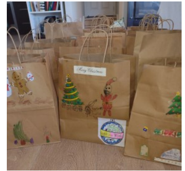
Schools decorated the giftbags

Primary schools, who have their busiest time of the year in the final term, collected making sure there were necessities and things for joy; they decorated packets to create individual gift bags, cards were created, baking was done things. People encouraged colleagues to donate from the list of suggestions. At OLHC 10 bags filled with necessities and treats appeared anonymously. Youth groups brought in extra treats, people arrived did the tasks and carried on. Things just got done. How? I don't know. By whom? I don't know. After everything was cleaned up and packed away, all that was left was a memory of a most fantastic event where everyone in the community had done all things with great love. On behalf of the SVdP, New Plymouth team thank you.