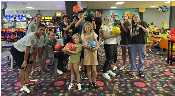
Parish Youth having fun bowling during the holidays .