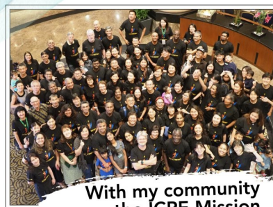
With my community the ICPE Mission

At the end of my trip, I had an opportunity to meet my brothers and sisters at the ICPE Mission, the international community I belong to. There were about 200 people gathered for the community gathering.