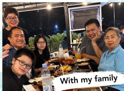
With my family

I had many questions and wondered why it happened to my family and me. But I believe God allows terrible things to happen because He loves me. He stretches my heart, deepens my trust, and strengthens my faith.