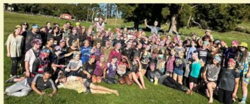
PHOTO: A GROUP PHOTO AT CONFIRMATION CAMP - FRIDAY, 7 JUNE TO SUNDAY, 9 JUNE 2024