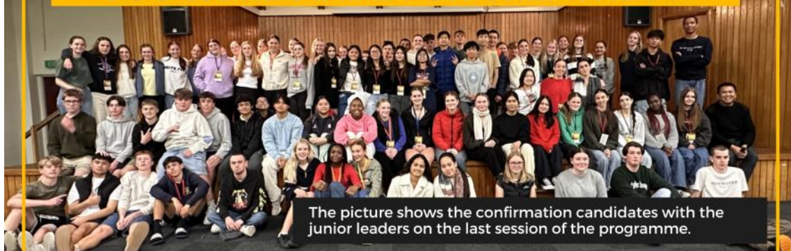
The picture shows the confirmation candidates with the junior leaders on the last session of the programme.

Today, 60 candidates have been officially confirmed after receiving guidance to prepare for their confirmation.