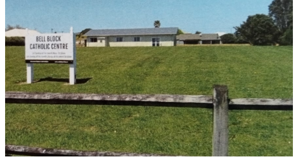
Bell Block Catholic Centre, Parklands Ave.