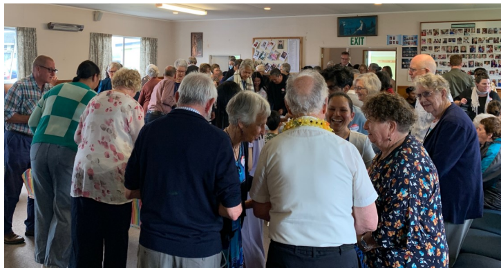
Conversations over lunch