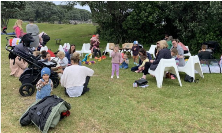
Pictured above: Last week, we took our Little Angels group outdoors! We played and sang at East End Beach – it was a lovely morning with everyone!

CLARETIAN 2024 BIBLE DIARIES FOR SALE: The Bible diary consists of daily prayers, readings, short reflections, Saints of the day and short quotes for the year. Prices range from $20.00 to $29.00. Please make an order now with the link below: https://www.cognitofirms.com/AlexBailey1/AotearoaNewZealandBibleDiaries2022 For those that do not use electronic devices, please contact Fr Prakash directly on 022 585 2875.