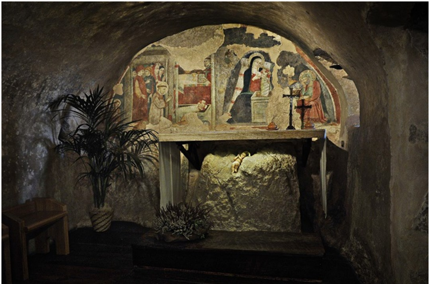
Cave where Saint Francis of Assisi staged the first-ever nativity scene on Christmas Eve in 1223.

St Juliana Fraternity Secular Franciscans Palmerston North