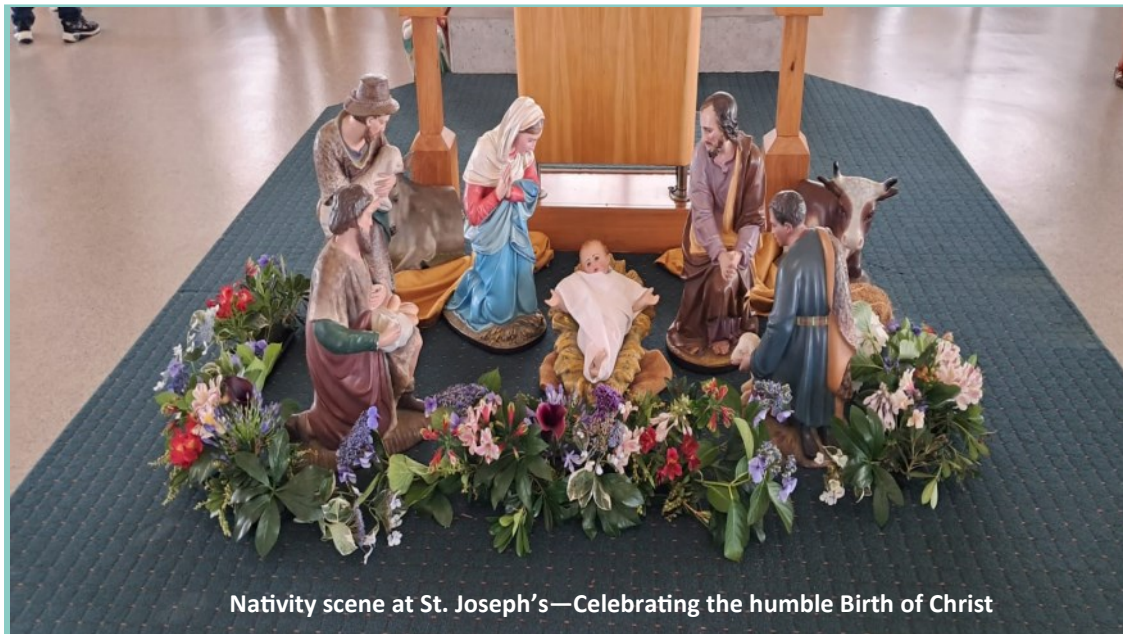
Nativity scene at St. Joseph's—Celebrating the humble Birth of Christ

The parish joyfully celebrated Christmas in our churches at St. Patrick's Okato, Bell Block Catholic Center, Our Lady Help of Christians and St. Joseph's with St. Joseph's hosting a reverent and uplifting Midnight Mass. The youth ministry, together with the "Mustard Seeds", the Youth band, set a warm and festive tone through heartfelt carols before the Mass, drawing the congregation into the spirit of the Nativity. With grace and devotion, the youth guided the procession and tenderly placed the Infant Jesus in the crib—a moment both profound and moving.