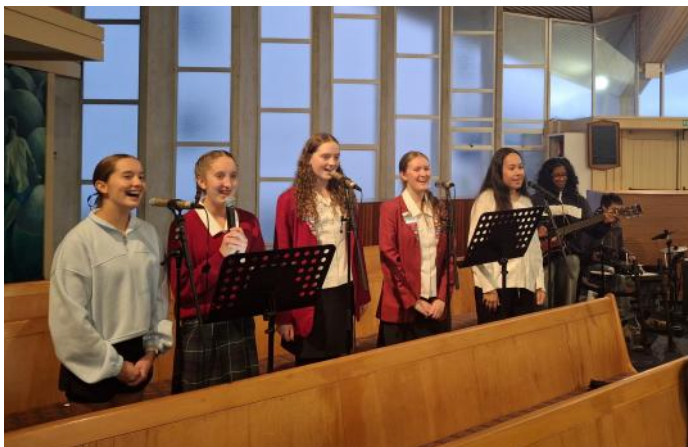
Some of the Mustard Seeds practising for Youth Mass 27 July

PLANNED GIVING ENVELOPES: The new sets of white giving envelopes begin Sunday 27 July. Please pick up your set from the church foyer, but let the office know if you can not see your envelopes. They will be able to help.