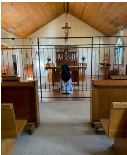
Perpetual Adoration at the chapel at Tyburn Ngakuru Rotorua. Perpetual Adoration is ongoing adoration for 24 hours