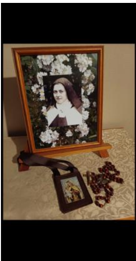
St. Thérèse of Lisieux, who was a French Catholic Discalced Carmelite religious, now widely venerated in modern times.

Secular Carmelites are lay people living our faith and Carmelite vocation in the secular world, in the midst of our situation, be it married, widowed or living a single life. As prayerful people we bring God's presence to others, whatever their situation.