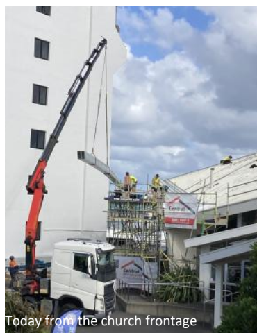
Today from the church frontage

WHATS HAPPENING WITH THE ROOF: Work on the new roof at St Josephs church began last month. It seems that the small piece near the tower is finished and the roofers are making their way around the church, starting on the Devon Street side & working anti clockwise to the front of the church. We expect the roofers to be here until March, all being weather dependent . This means that the scaffolding is still up and the parking is still reduced. Please leave the disabled parks for those with disability stickers. It might mean a little walk, but there is always plenty of parking in Powderham Street.