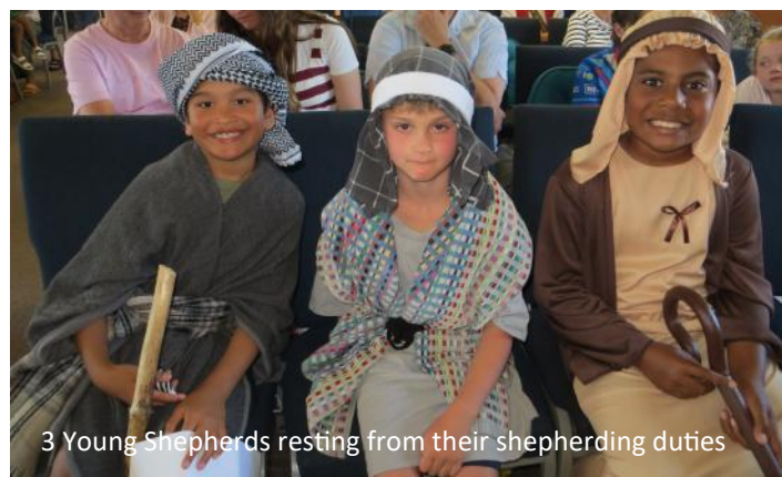
3 Young Shepherds resting from their shepherding duties