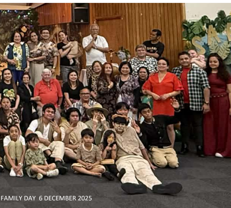
FAMILY DAY 6 DECEMBER 2025