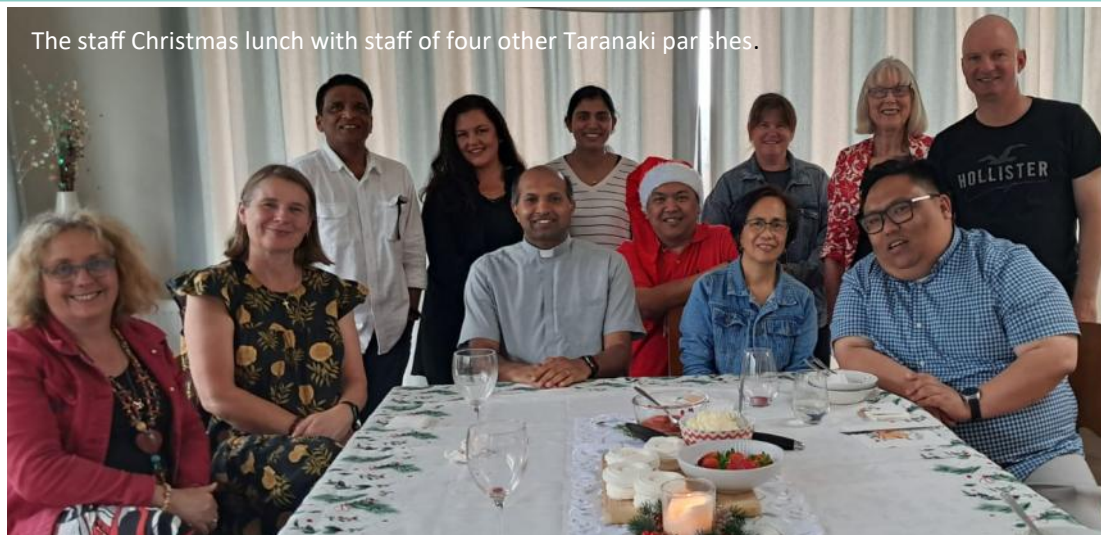
The staff Christmas lunch with staff of four other Taranaki parishes.

Preference interviews will begin Thursday 22nd January. Appointments necessary.