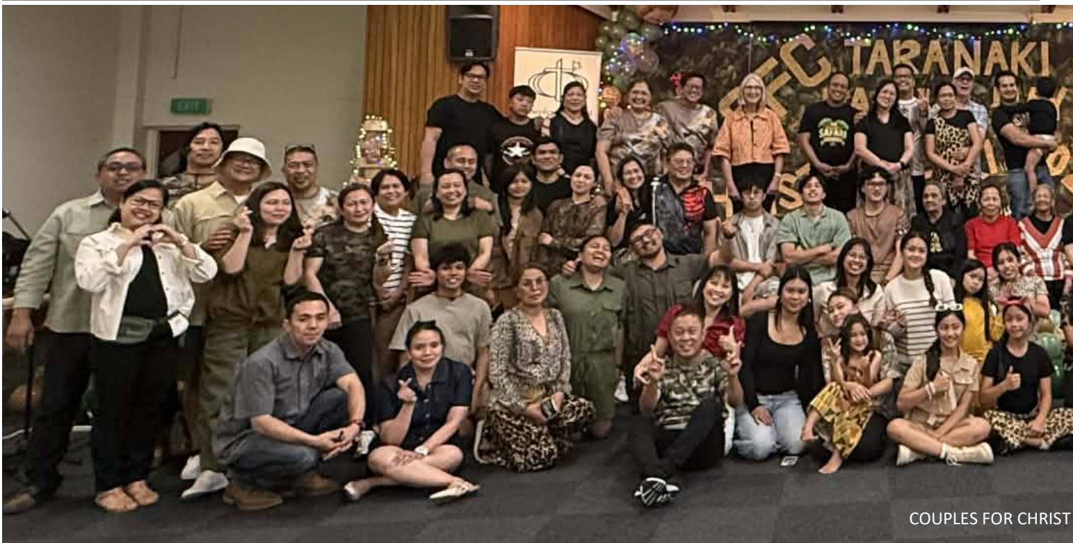
COUPLES FOR CHRIST