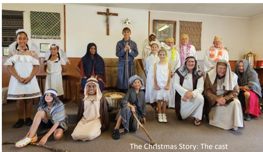
The Christmas Story: The cast

WHATS HAPPENING WITH THE ROOF: Work on the new roof at St Josephs church began last month. It seems that the small piece near the tower is finished and the roofers are making their way around the church, starting on the Devon Street side & working anti clockwise to the front of the church. We expect the roofers to be here until March, all being weather dependent . This means that the scaffolding is still up and the parking is still reduced. Please leave the disabled parks for those with disability stickers. It might mean a little walk, but there is always plenty of parking in Powderham Street.