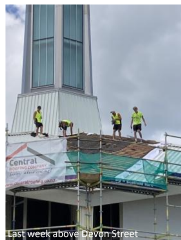
Last week above Devon Street