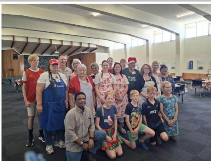
The St Vincent de Paul Helpers prior to serving the meal.

ST VINCENT DE PAUL COMMUNITY DINNER: The last dinner for the year was held Tuesday 9 December and this was celebrated in true Christmas style. There was a fantastic atmosphere among the diners (63 adults, 15 teenagers and children). Everyone was happy. The menu was sausage rolls, meatballs, chicken, ham, coleslaw, potato salad. Puddings just flowed from the table onto plates. There was a fabulous fruit salad, pavlovas, trifles, ice cream, Christmas cake, biscuits, mint balls and Russian fudge.