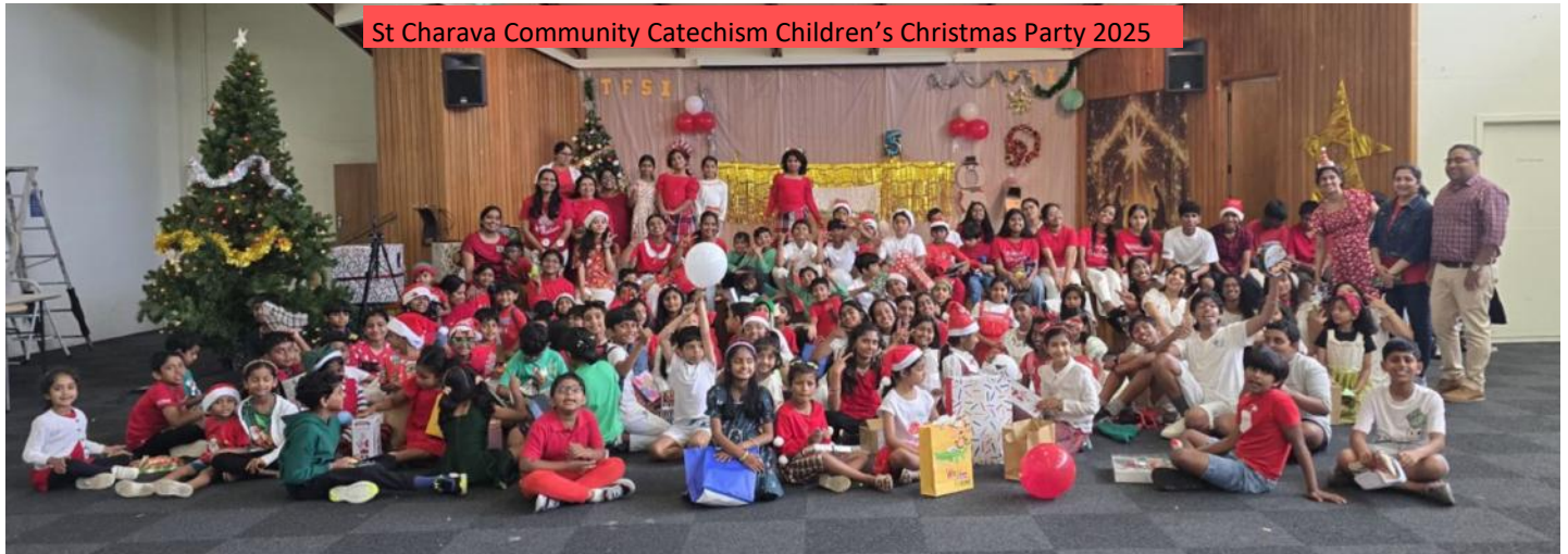
St Charava Community Catechism Children's Christmas Party 2025