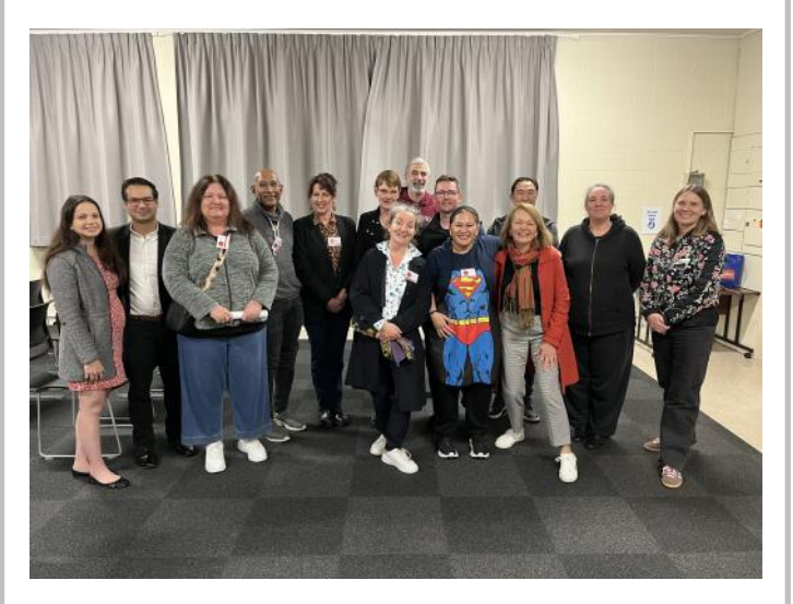
The Alpha Team prior to the Week 4 meeting. The Hospitality Team aren't in this photo as they were busy in the kitchen.

We are looking forward to the retreat, Friday 13 June and Saturday 14 June. The Retreat is a key point in the Alpha experience and we pray for the success of this weekend. We pray for all in the Alpha Programme. Come Holy Spirit Come.